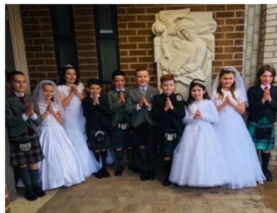
Some of our Primary 4 children who recently received the Sacrament of First Holy Communion in St. Matthew's Church.