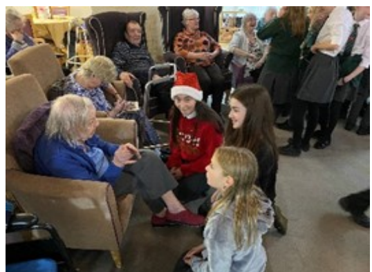
P7(2019-20) visiting our local care home