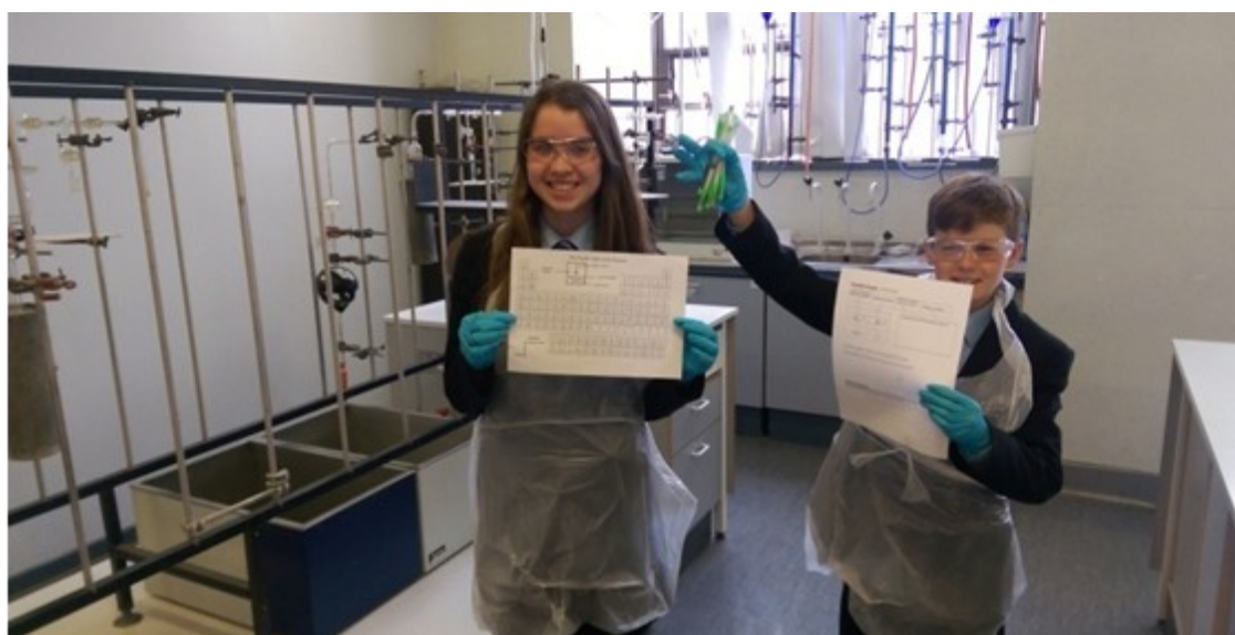
Finding the prizes for the scavenger hunt!