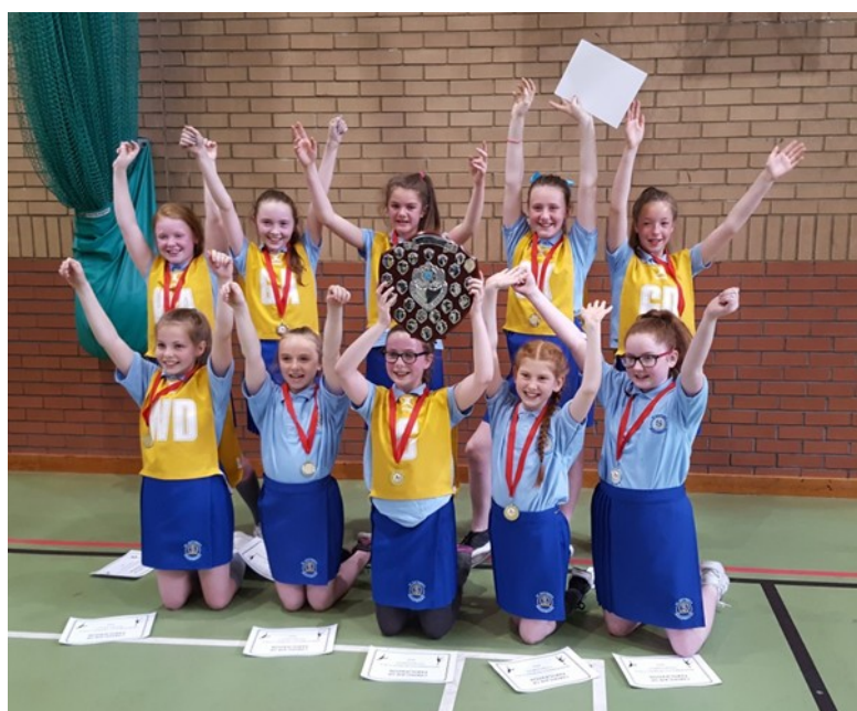
St Matthew's winners of the Gala Netball Competition