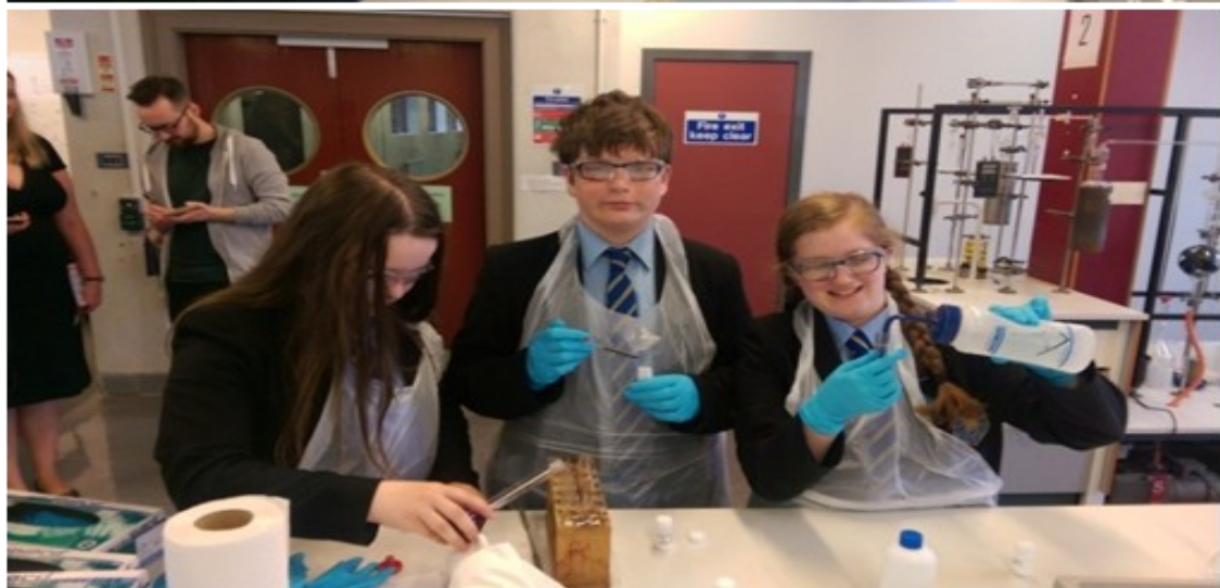
Solving the mix up at the factory!